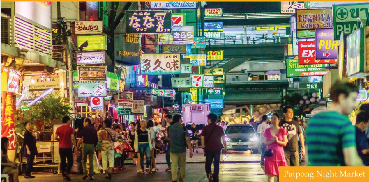
Patpong Night Market